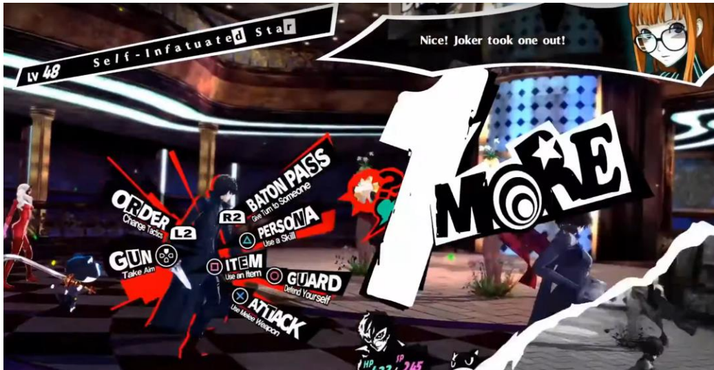
Persona 5 Royal - 1 More!

The 1 More! mechanic is the second step in this main responsible for breaking the normal Turn-Based Combat structure. It encourages the player to exploit enemies' weaknesses to take more turns, which results very advantageous in battle against multiple enemies, adding another layer of strategy.