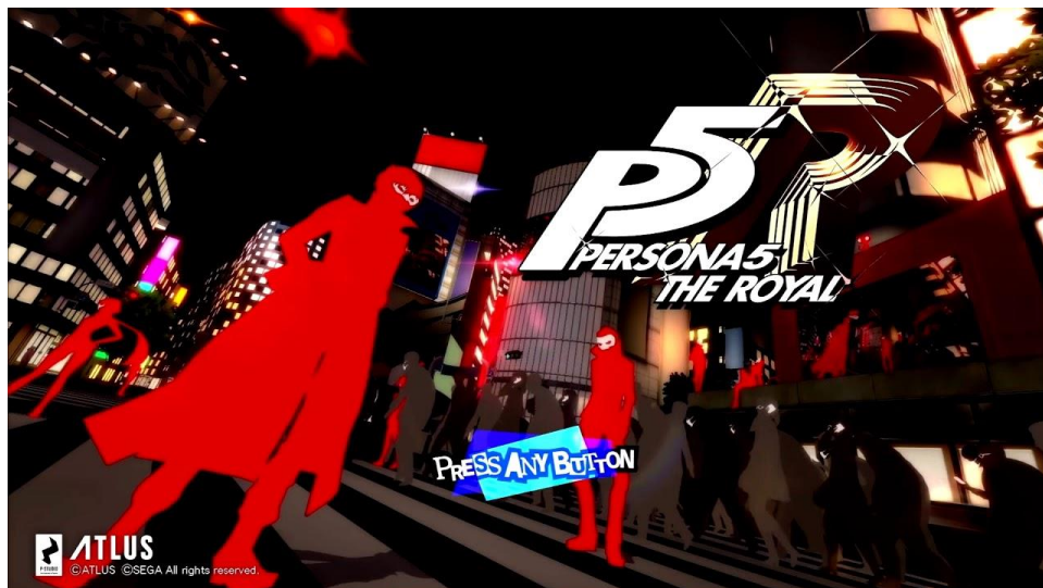
Persona 5 Royal - Main Screen

The core mechanic analysis for a game like Persona 5 Royal is a demanding job that requires some preliminary analysis of the game, isolating each system and core mechanic. We then will focus on its innovative Turn-Based Combat system, highlighting one of its most interesting mechanics: the Baton Pass mechanic.