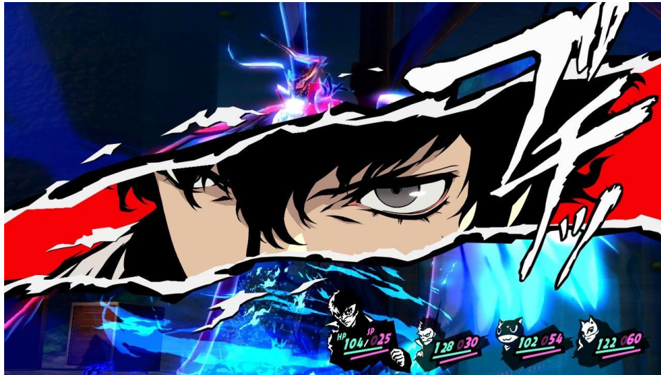
Persona 5 Royal - Incoming critical hit animation

Critical Hits mechanic is the first step in a system well designed to positively enforce this strategy. Every critical hit gives amazing feedback with its combination of VFX, SFX, and companion compliments creating nice feedback from the player.