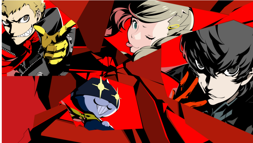
Persona 5 Royal - All Out Attack start animation screen

Another last element that contributes to the amazing Persona 5 combat experience is the All Out Attack. The All Out Attack can be performed after knocking down all enemies, is a devastating attack featuring all team members in an acrobatic finisher that ends in different ways based on which character started the attack. Other than being one of the most powerful attacks at players' disposal, the animation itself is satisfying to watch and it alone can push the player to use this mechanic.