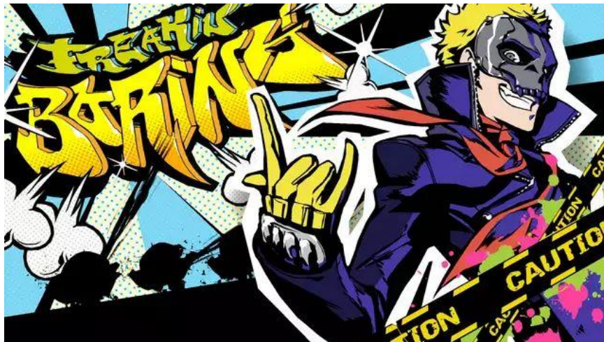
Persona 5 Royal - All Out Ending featuring Ryuji